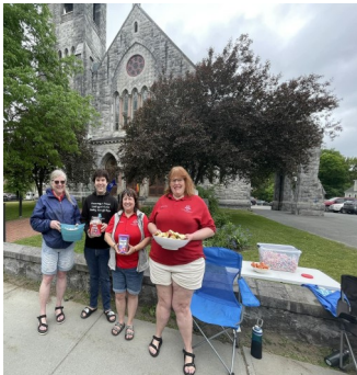
Pet Parade Outreach

This has been such a busy and meaningful Summer that I want to take up all the space I am allotted here on the front page with wonderful photos that tell the story.