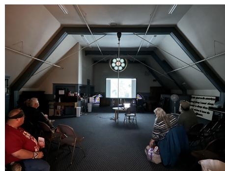
Watching Harvey at our Movie Night on the top floor