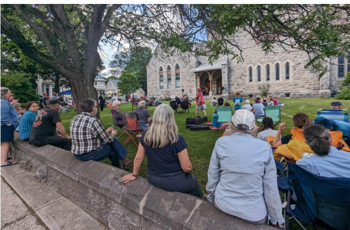
Make Music Day on South Lawn